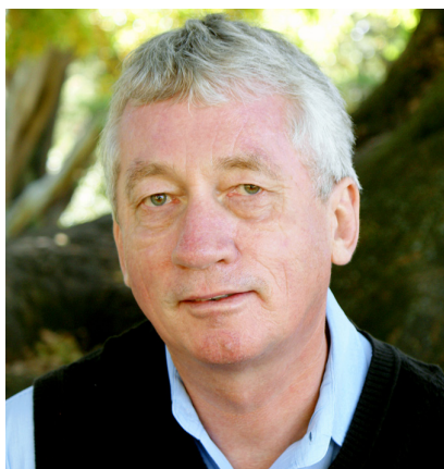
Frans de Waal C.H. Candler Professor of Primate Behavior at Emory University